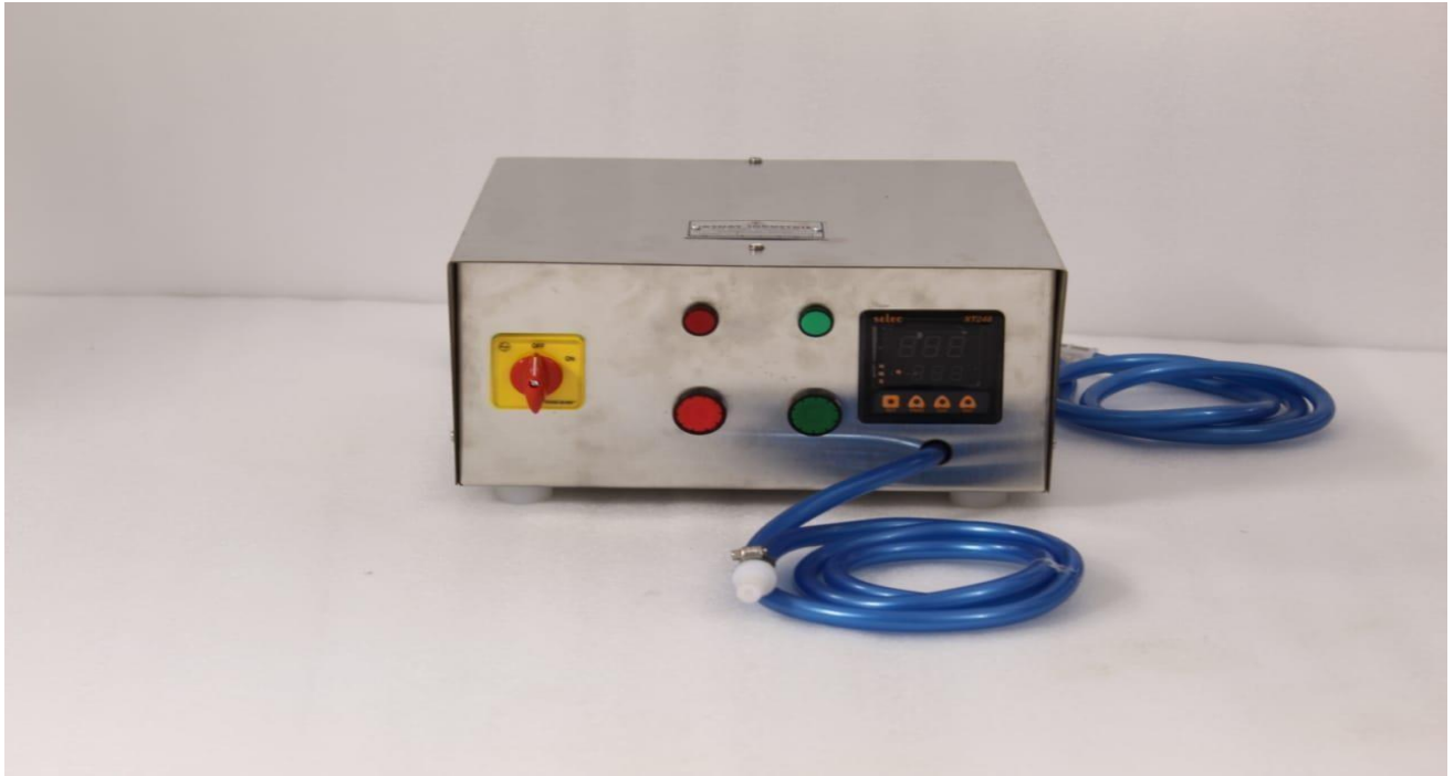
SYRUP FILLING MACHINE