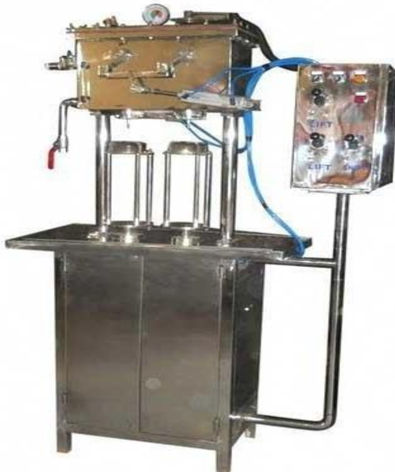
TWO NOZZLE GOLI SODA RINSING MACHINE